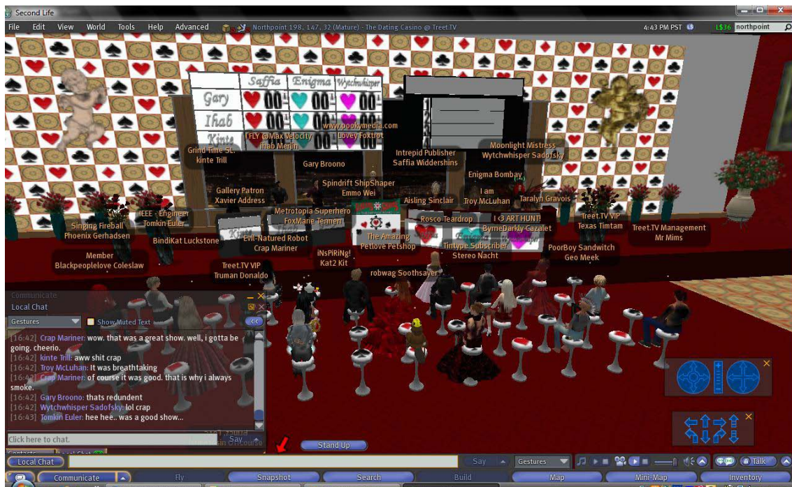
Figure 2. The Dating Casino , February 14, 2011