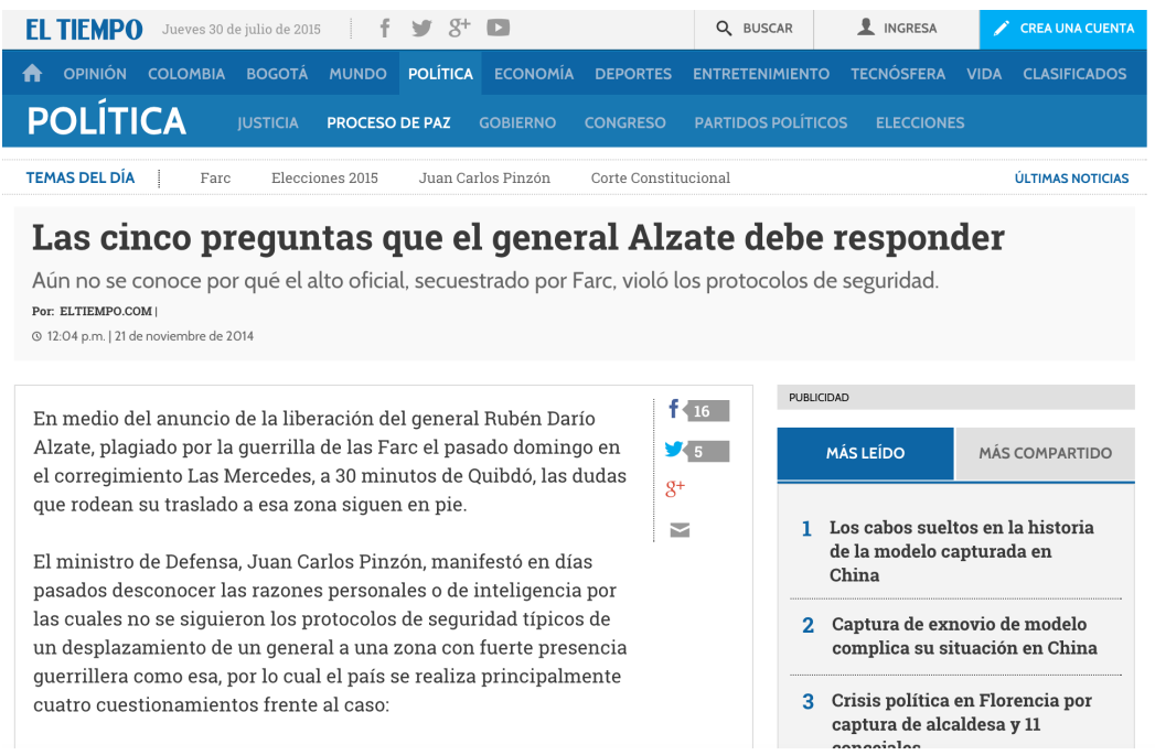
Screenshot: The Five Questions That General Alzate Needs To Answer.

While the article itself doesn't provide any preliminary hypotheses that could explain these issues, it represents an intersection between mainstream and radical media approaches to the Alzate case. The journalistic practice of asking open questions foments individual analysis, a strategy that is more likely to appear in radical media as a way of promoting the inclusion of different viewpoints in a possible debate.