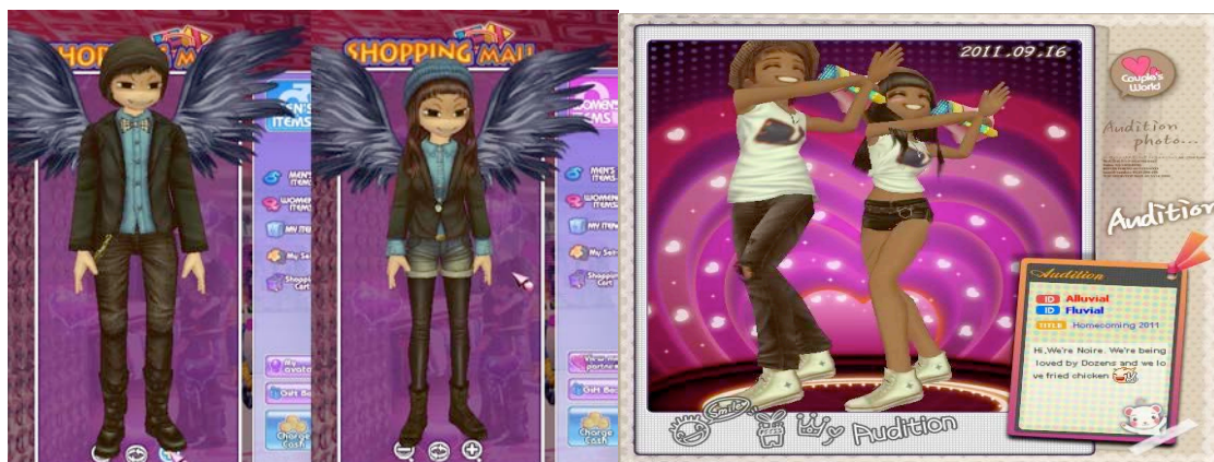
c. Out-battle matching clothing and accessories