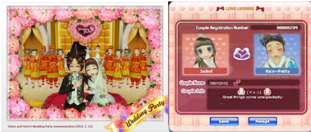
c. A wedding