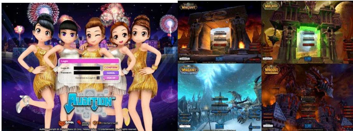
Figure 1: Login screens of Audition and WoW (as of January 2013)

is a non-violent, non-fantasy MOG, with colorful designs, cute avatars, and a popular marriage system (see below) that mediates and facilitates couple-related collaborative behaviors. In contrast with previously studied MOGs such as WoW , which tend to be male dominated, Audition has a balanced gender distribution among its players (female: 48.6%; male: 48.1%; unknown: 3.3% 1 ); thus, it is an especially appropriate MOG in which to study marriage, which is overwhelmingly heterosexual, both in MOGs and in mainstream society. More and more MOGs are developing marriage systems to enhance players' playful and immersive experiences (Lo, 2009; Wu et al., 2007). In contrast to the "particularly masculine pursuit" (Selwyn, 2007, p. 533) of violent and/or fantasy-based games (e.g., WoW ) (see Figure 1), these games (e.g., Dance Online , Dance Groove Online , HighStreet 5 ) constitute a growing game industry that attracts many female as well as some gay male players.