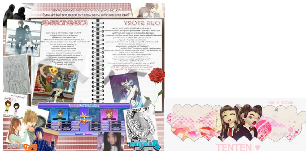
a. A love story