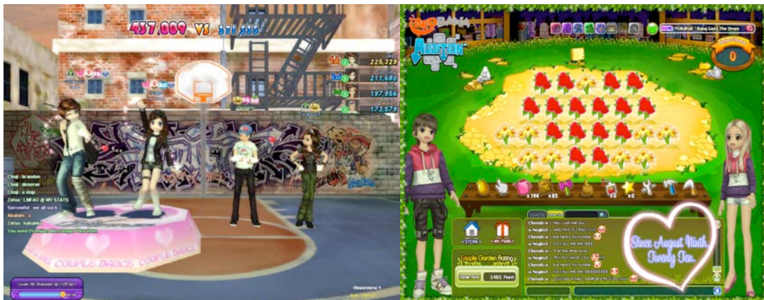
a. In-battle dance competition

theme. Figure 4b shows an out-battle collaboration: A couple built a garden together in the “couple farm,” another in-game location. Their chat (depicted in the screen capture) after they finished decorating this garden was also a collaborative activity, based on the lyrics of Carly Rae Jepsen’s popular love song “Call Me Maybe”: One member of the couple typed a line from the song, and the other typed the next line. In this way, they showed both coordination and romantic feeling. Couples also work together to design their clothes, poses, and accessories to construct a “perfectly matched” couple image (Figures 4c, 4d). These activities consume time, energy, and money, but they do not benefit players in terms of game status or levels. The probable motivation is the emotional intensity that the couples feel or seek through the development of a romantic relationship.