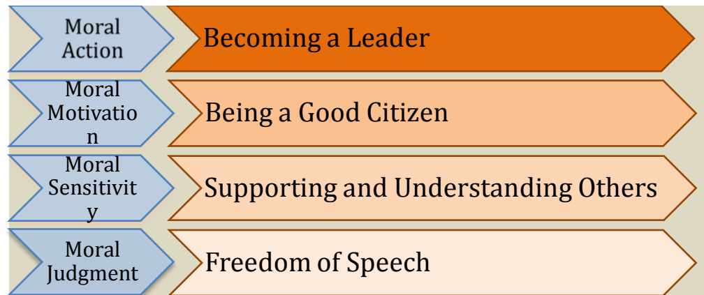
Figure 2 The themes around moral functioning that emerged from the study

responsibility and/or a leadership role (e.g. activism in the local community); 2) Moral motivation meant in terms of identity-building and choosing good values (e.g. plagiarism and presentation of self); 3) Moral sensitivity meant in terms of supporting and understanding others. (e.g. connecting to others or offering support and encouragement); and 4) Moral judgment meant in terms of reasoning ethically and analyzing ethical problems (e.g. freedom of speech) (Fig. 2)