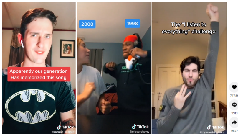
Figure 3. Generational and music genre affiliations examples.

Fourth, there are patterns in how some features of TikTok are used more frequently than others in this challenge. For instance, there is a limited use of transitions, as TikTokers focus on a single-take with no cut-scenes in their lip-syncing, singing, and reactions. Text is also frequently employed to shape meaning to the storytelling, via internal monologues or role-playing dialogue displayed in overlay text.