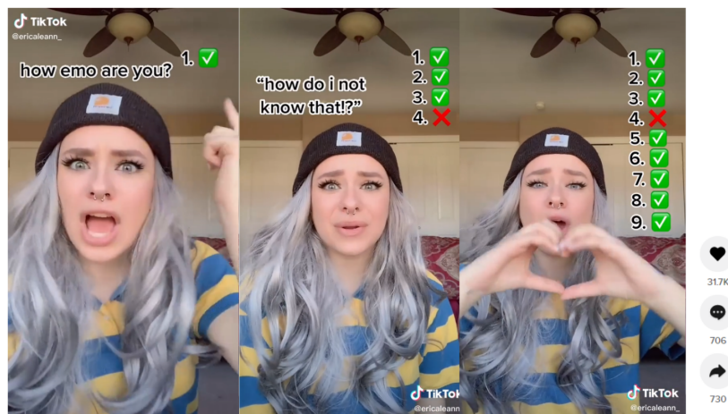
Figure 2. Cultural storytelling: Example of urban tribes.

Second, this trend is constituted as a storytelling mode. This means that the challenge goes beyond a mere competition. In Figure 2, we see examples where the TikToker expresses emotion when recalling songs from a particular genre of music (e.g. pop-rock), or belonging to an urban tribe (e.g. emo). From a sociological perspective, urban tribes refer to city youths gathered in small, fluid groups that share interests from mainstream cultures (Friedman & McNabb, 2014). When the TikToker dares users with the text "How emo are you?" and joins in, they are claiming authority and belonging to that tribe.