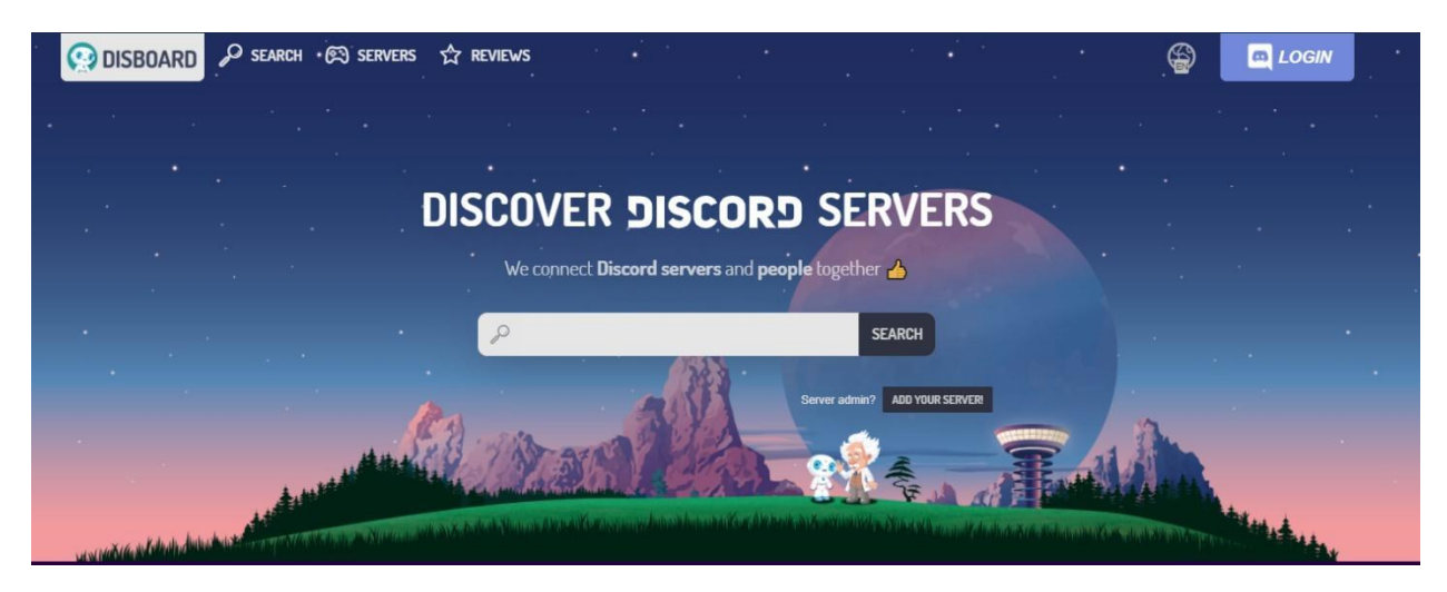
Figure 3. Disboard imitates the 'cuteness' of Discord.

That these hateful structures exist is less important for Discord than if they exist visibly —and herein lies the financial impetus for Discord to continue to allow sites like Disboard to do its dirty work, as it maintains a presentable image for its ongoing expansion. Although Discord's in-house search promotes only curated servers, it has allowed third-party services to imitate its user interface (Figure 3), and network hate on its behalf.