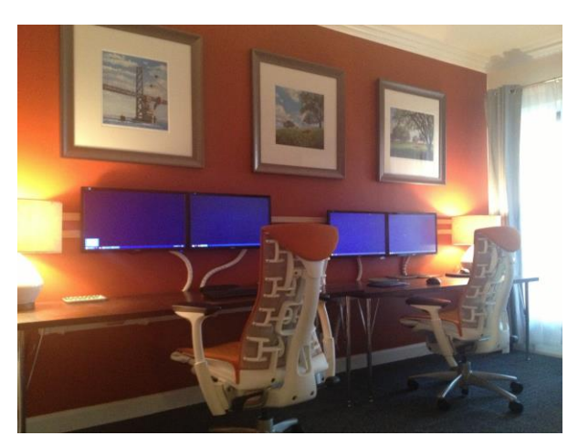
Figure 4, More Deathstar than Battlestation