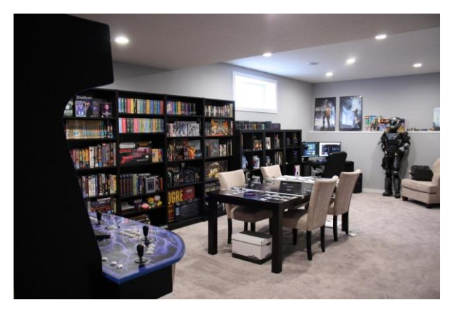
Figure 5, My Battlestation Room