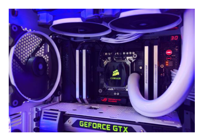
Figure 2, My first triple screen battlestation