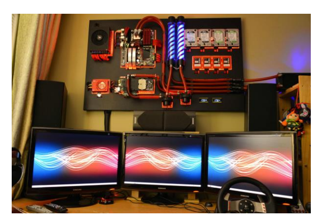
Figure 3, I present you my watercooled wall mounted rig