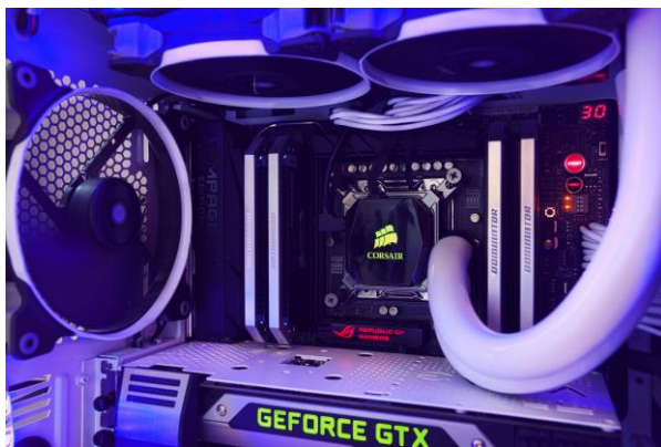
Figure 2, My first triple screen battlestation