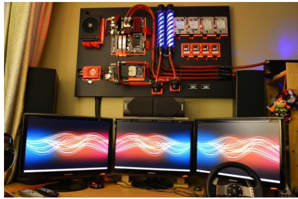
Figure 3, I present you my watercooled wall mounted rig