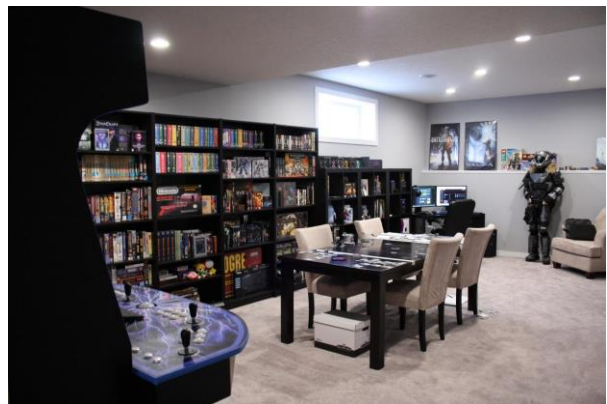
Figure 5, My Battlestation Room